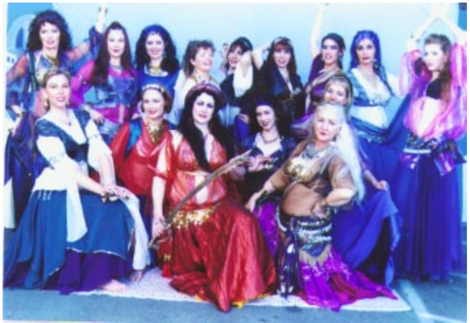
A blast from the past! A happy snap from a previous Extravaganza. are you here ?