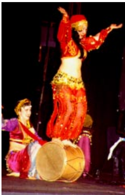
No, you're not seeing things! Picture from the recent Sydney Festival Concert.

It's that time of year again! - when we get to showcase the talent of our teachers, choreographers, and dancers at the 11th Annual Academy of Middle Eastern Dance Extravaganza.